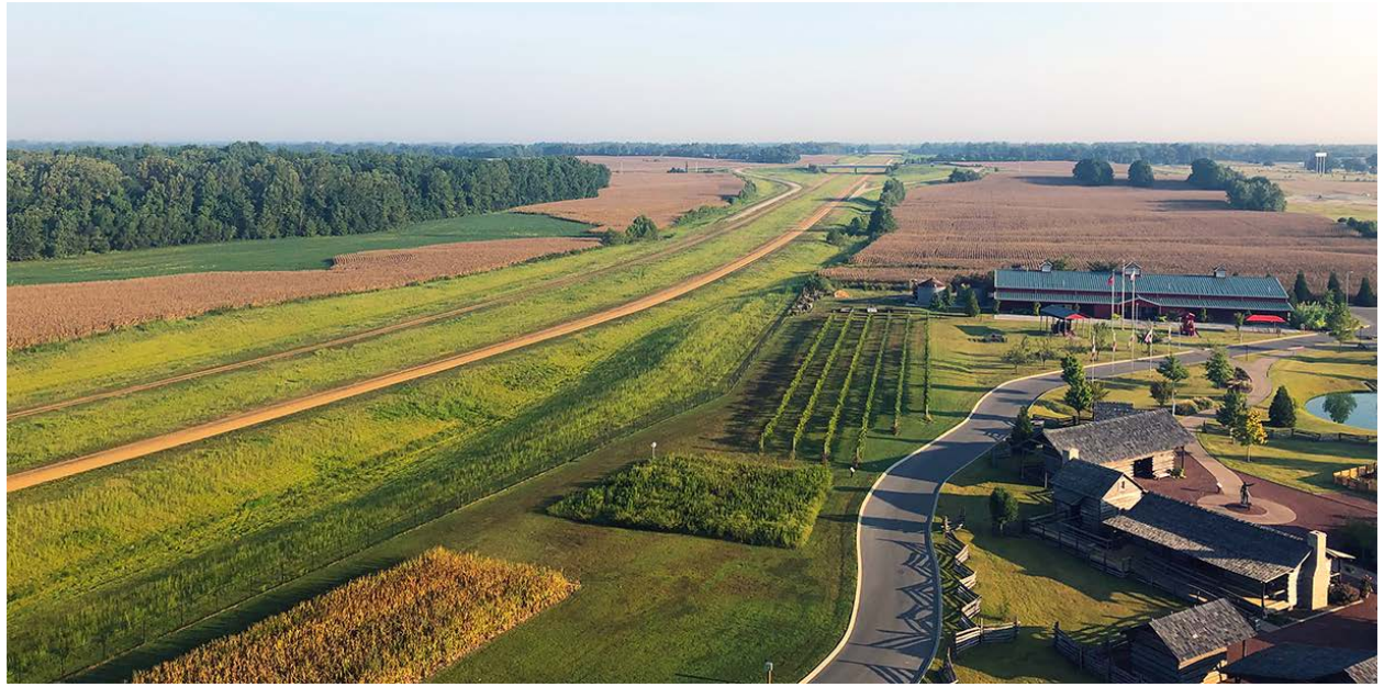
The Intermodal Surface Transportation Efficiency Act of 1991 included two high-priority corridors that would later become parts of I-69. Corridor 18 from Indianapolis, Indiana, to Memphis, Tennessee, via Evansville, Indiana runs behind Discovery Park of America in Union City, Tenn. As you can see, much of the work has been completed, including exit ramps on each side of the park. The section you see here that runs alongside Discovery Park from a little northwest of the former Wingfoot Golf Course to Reelfoot Avenue was the first of three projects (the middle project) that encompass the I-69 loop around Union City. The section to the southwest down to US 51 was the second section. Both segments have been completed up to final grading (ready for paving). Currently in the construction phase is the section a little northwest of the former Wingfoot Golf Course to US-45 & US 51 about halfway to Fulton. All three segments will be completed and paved by fall of 2023. This will open the entire Union City loop. The remainder of the project including the exchange in Fulton, Kentucky and the section south of Union City all the way to Dyersburg is currently in various phases of development.