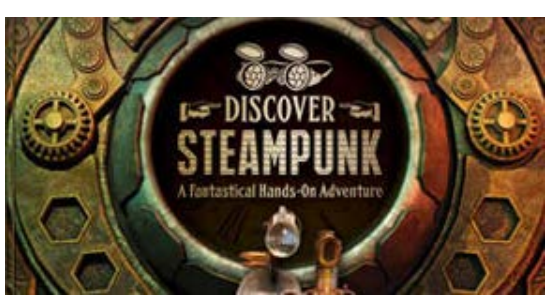
June 18, 2022 - Jan. 8, 2023

Discovery Park's education department and others will be utilizing The Farm Credit Mid-America Education Pavilion to spotlight topics relating to the business of agriculture along with growing cycles, garden design, soil health and other topics relating to the basics of plant science.