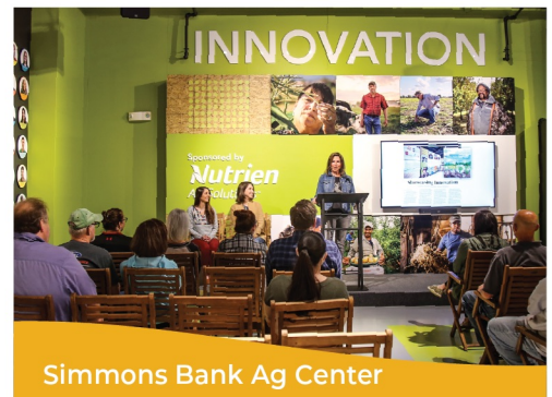
Simmons Bank Ag Center