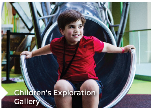
Children's Exploration Gallery